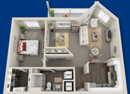
THE ASH 1 938 S.F.

We offer a variety of spacious one- and two-bedroom floor plans in a range of sizes.