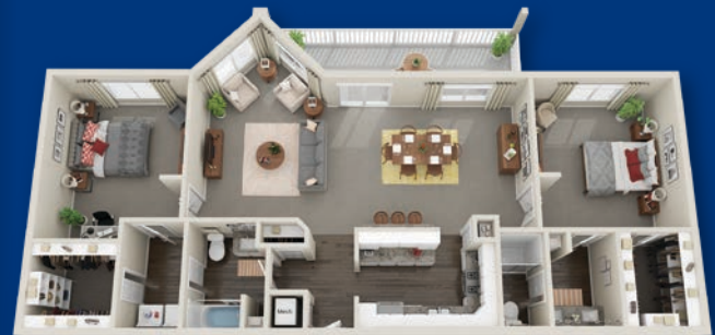
THE OAK 1,542 S.F.

View all floor plan options at TheArbordale.com